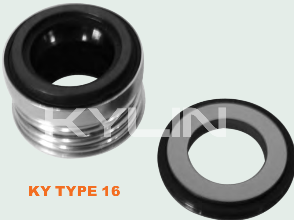
KY TYPE 16